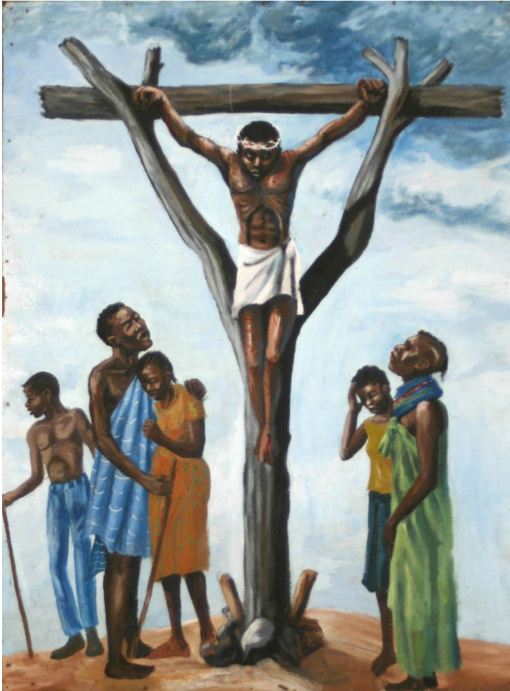
Stations of the Cross from Lodwar Cathedral, Kenya, © Fr Gary Howley. All rights reserved. Used with permission.

with opportunity for INDIVIDUAL CONFESSION