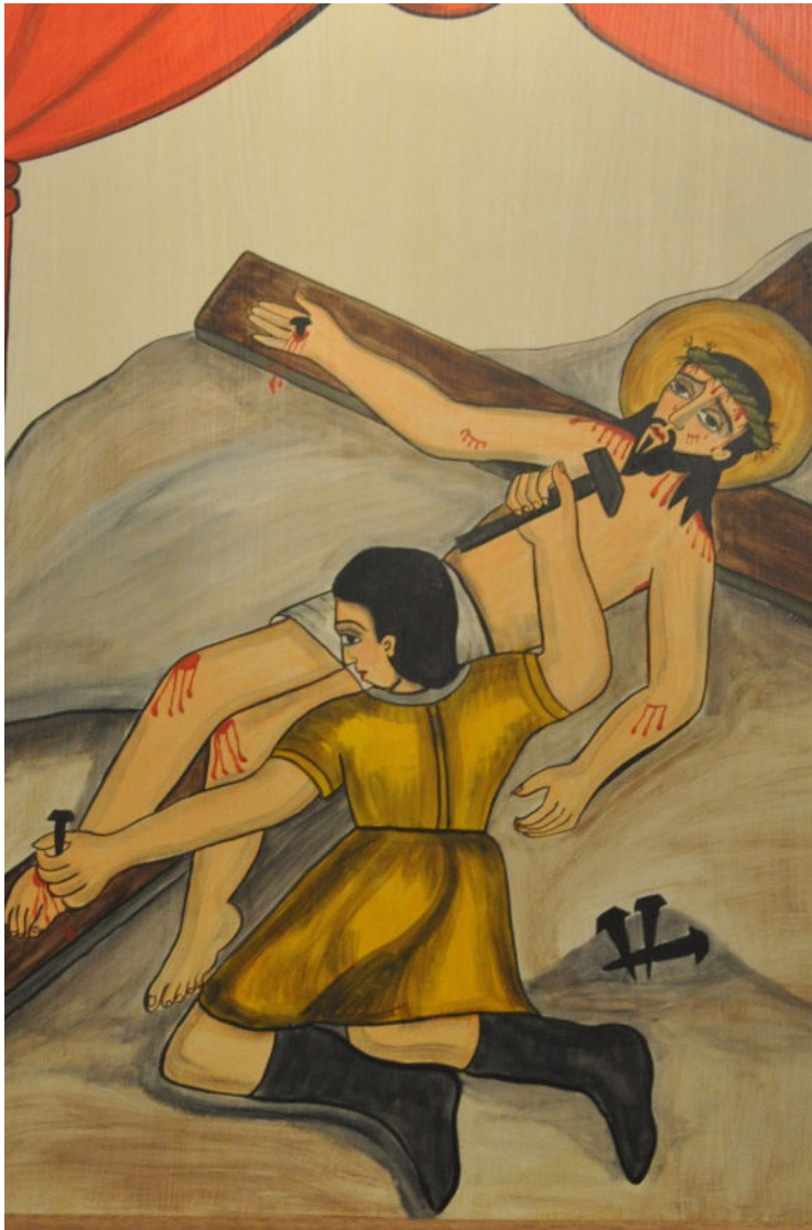
Stations of the Cross © Marie Romero Cash, Cathedral Basilica of St. Francis of Assisi, Santa Fe, NM. All rights reserved. Used with permission.

A guide to prepare for the reception of the Sacrament of Confession is located on the page 10. It is intended as a guide not as the absolute way in which the Sacrament is to be celebrated.