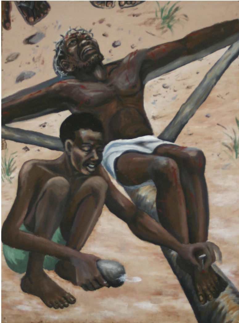
Stations of the Cross from Lodwar Cathedral, Kenya

Our prayer around the cross is our way to express our communion with the crucified Christ, but also with all those who suffer. We entrust our concerns for all those who are suffering to Christ, and we commit ourselves to work toward the salvation of the world.