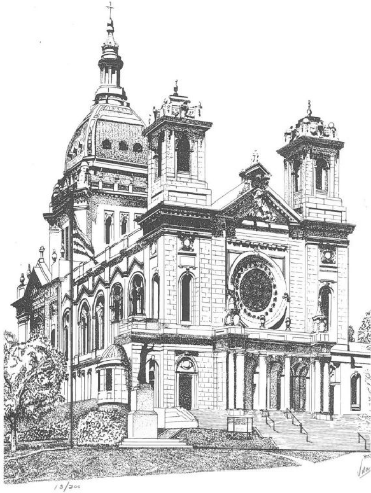
The Basilica of Saint Mary

In the Year of Salvation Two Thousand Twenty-Three