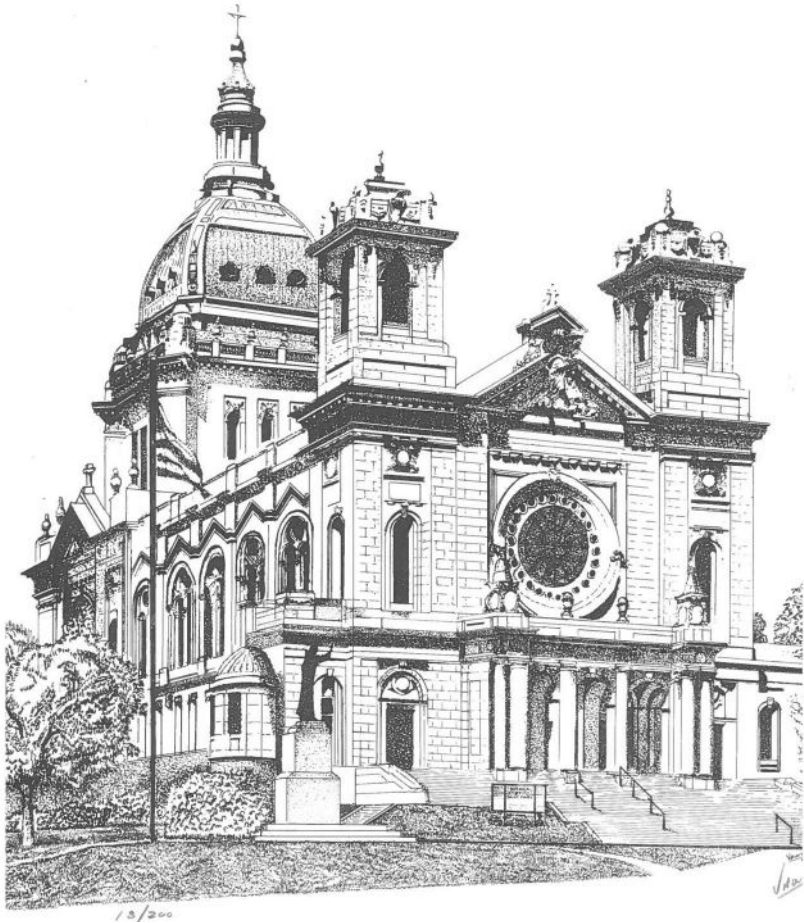
The Basilica of Saint Mary

THE BASILICA OF SAINT MARY SATURDAY, JULY 8, 2023 3:00PM