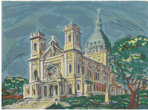
The Basilica of Saint Mary © 1969, Richard Hamilton. All rights reserved.

Text: Lectionary for Mass for Use in the Dioceses of the United States , second typical edition, © 2001, 1998, 1997, 1986, 1970; Confraternity of Christian Doctrine; Confraternity of Christian Doctrine. all rights reserved. Setting Donald B. Krubsack, composer-in-residence © 2015. All rights reserved. Used with permission.