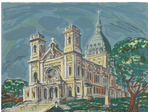
The Basilica of Saint Mary © 1969, Richard Hamilton. All rights reserved.

All rights reserved. Used with permission under OneLicense.net A-704048.