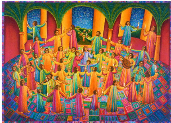
Celebration