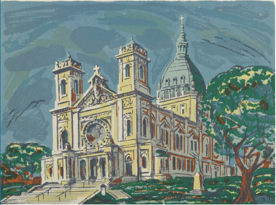
The Basilica of Saint Mary

In the Year of Salvation Two Thousand Twenty-Three