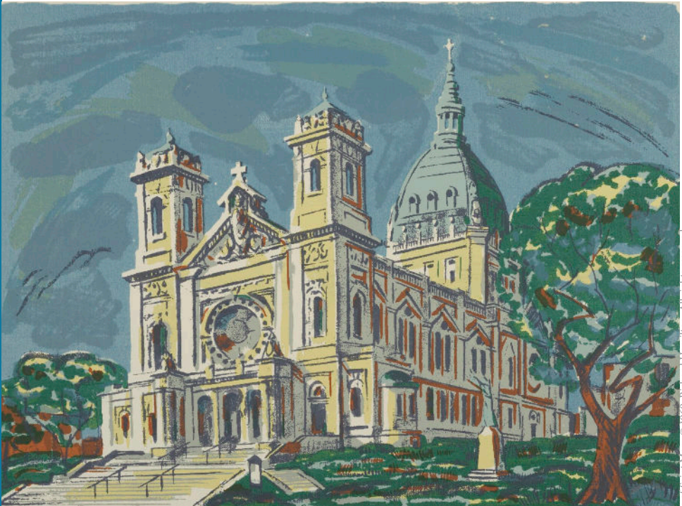
The Basilica of Saint Mary

In the Year of Salvation Two Thousand Twenty-Three