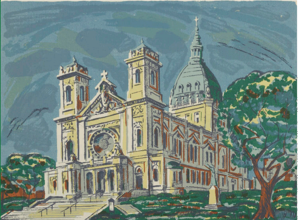
The Basilica of Saint Mary

In the Year of Salvation Two Thousand Twenty-Three