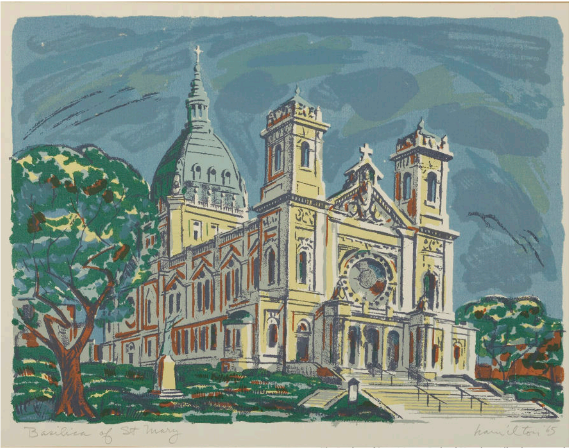
Basilica of St Mary