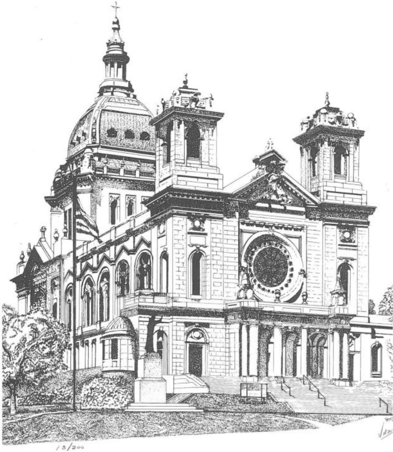
The Basilica of Saint Mary