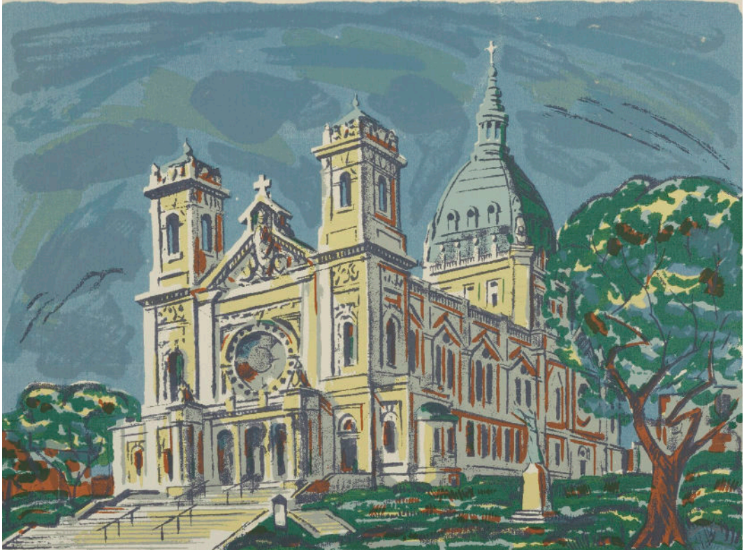
The Basilica of Saint Mary