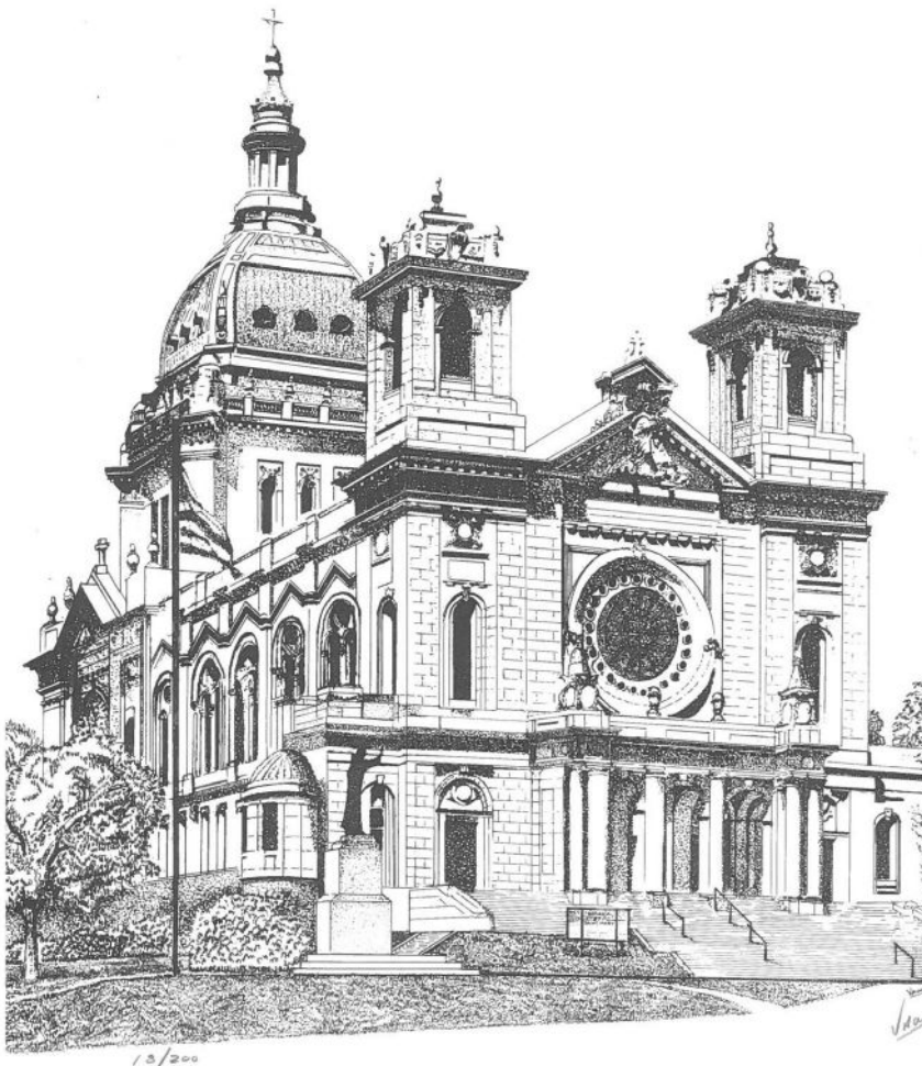
The Basilica of Saint Mary