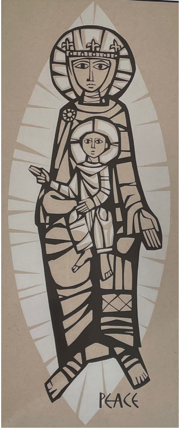
Madonna and Child