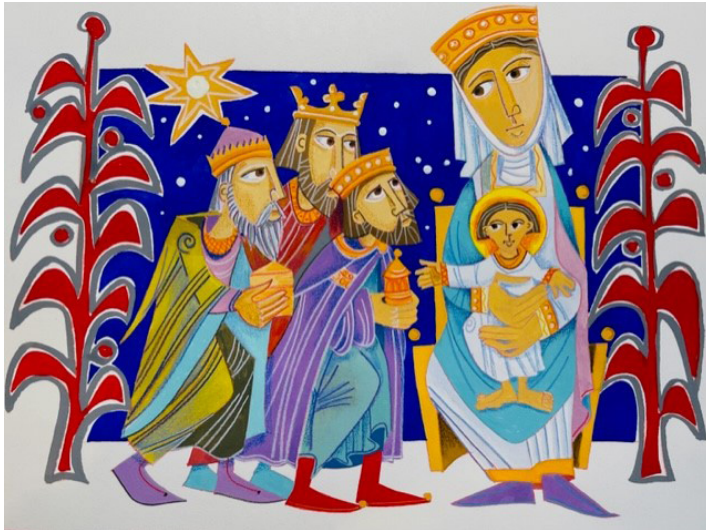
Magi, Mary & Child