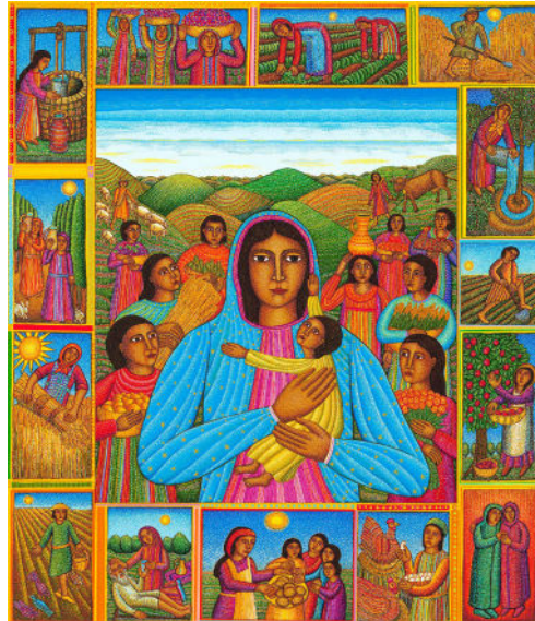
Madonna of the Harvest

After responding “Amen” to the opening prayer, please be seated.