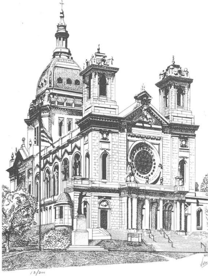
The Basilica of Saint Mary

In the Year of Salvation Two Thousand Twenty-Four