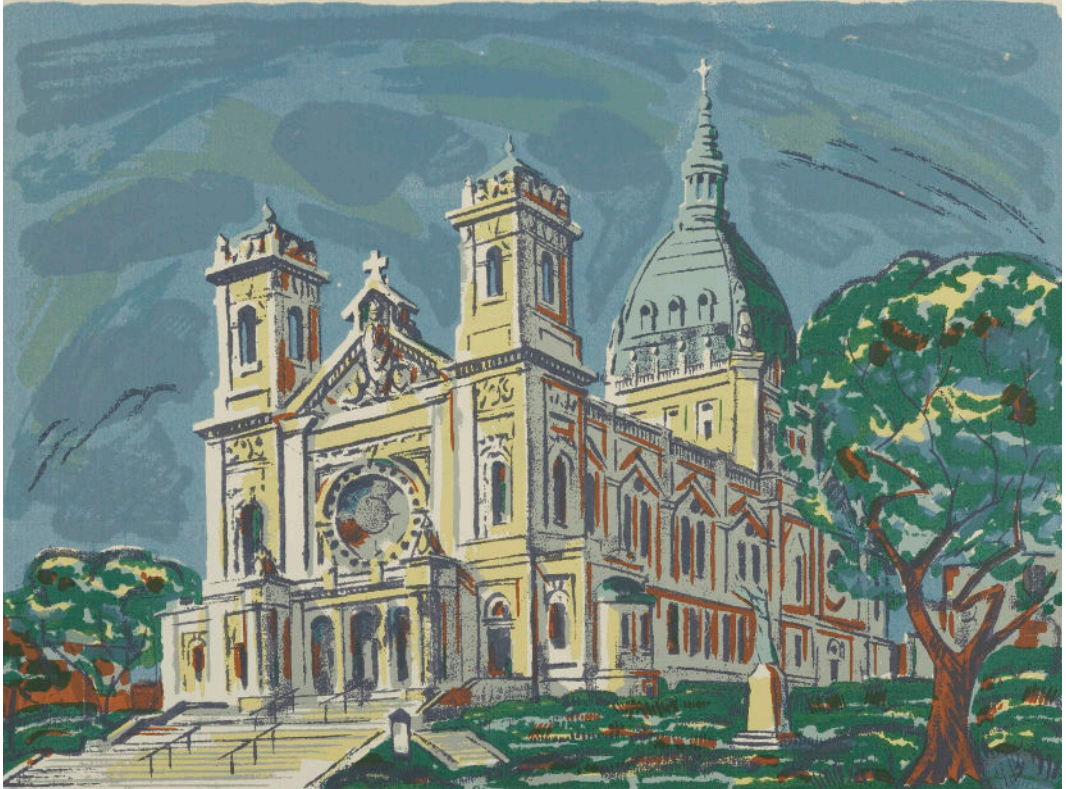
The Basilica of Saint Mary