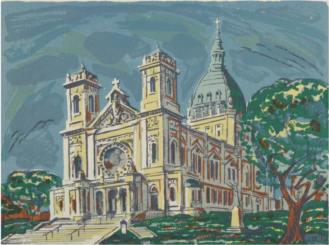
The Basilica of Saint Mary