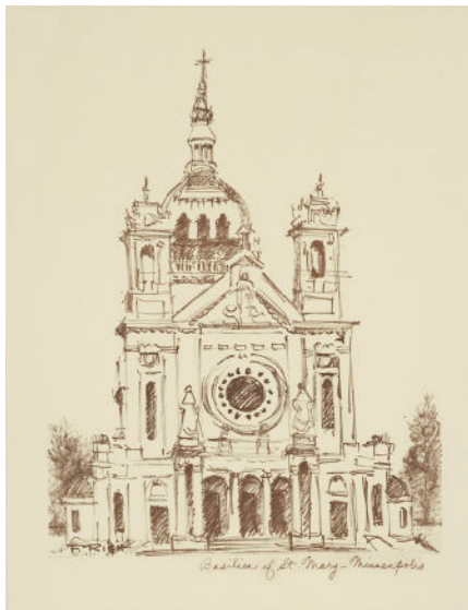
Cover Art: © F. Rich. Used with permission.

Welcome to The Basilica of Saint Mary, Minneapolis, Minnesota, The First Basilica in the United States.