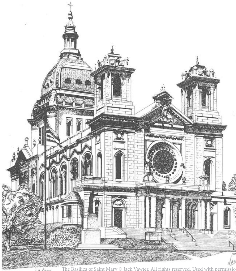
The Basilica of Saint Mary