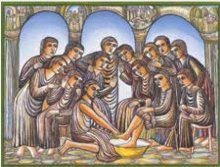
Washing of Feet