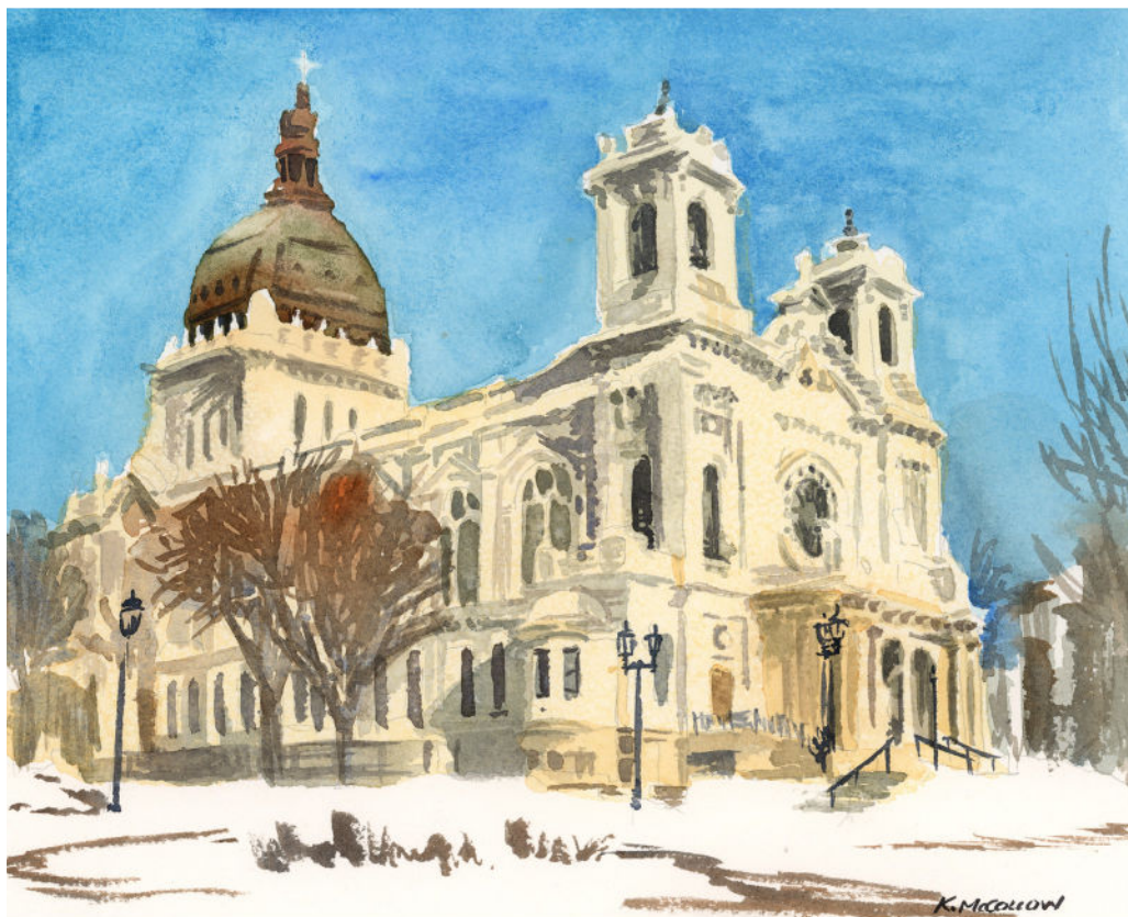
The Basilica of Saint Mary