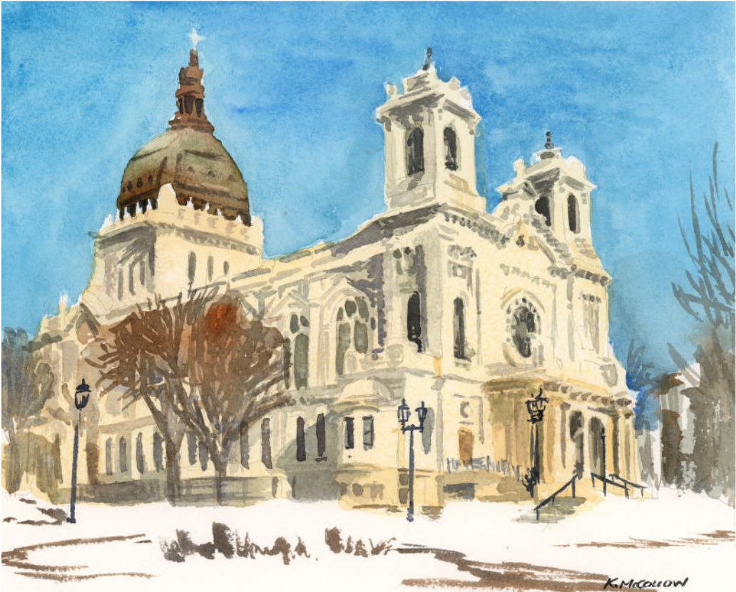
The Basilica of Saint Mary