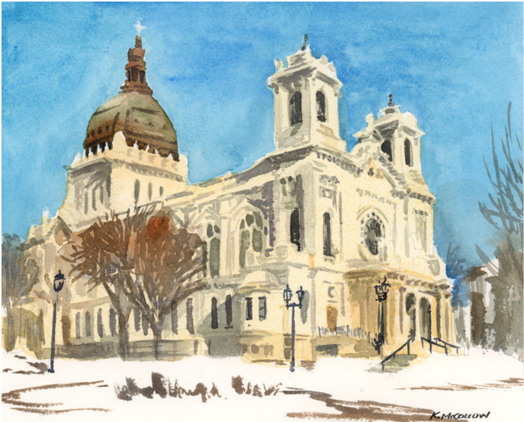
The Basilica of Saint Mary, © 2019, Katie McCollow. All rights reserved. Used with permission.