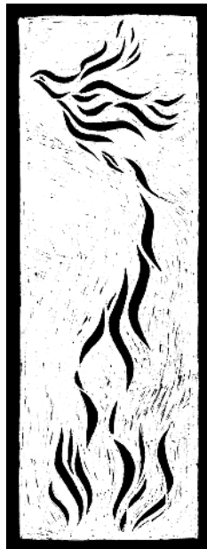
Penrecost © 2014 Lucinda Naylor | Eyekoms

ADVOCATE for Catholic principles and priorities in climate change discussion and decisions, especially as they impact those who are poor and vulnerable.