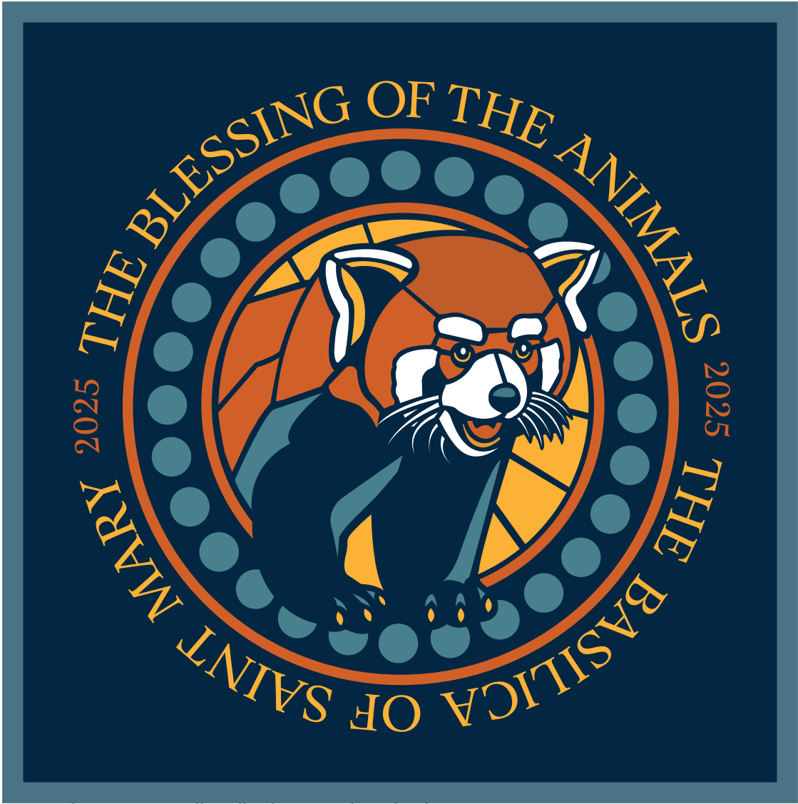
Artwork © 2025, Dan Miller. All rights reserved. Used with permission