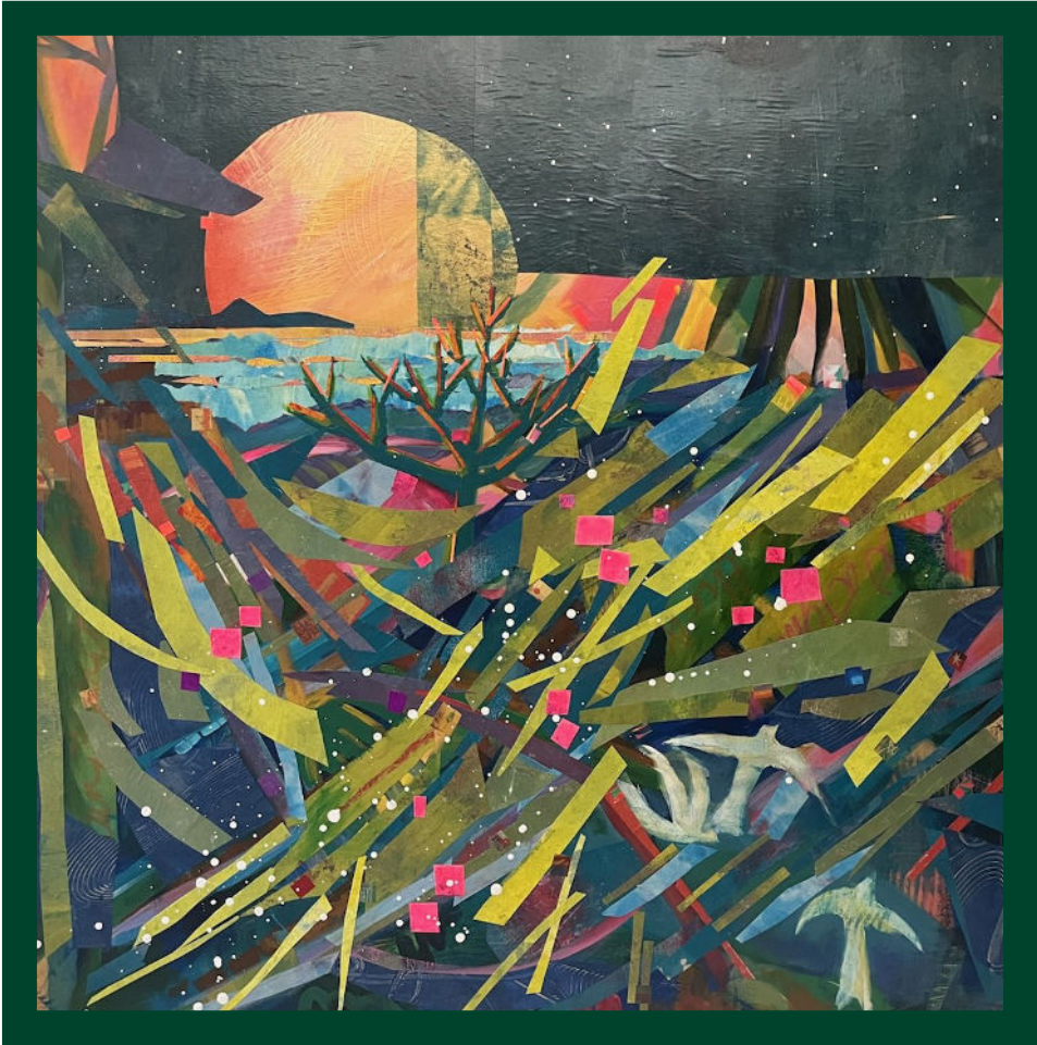
Creation, © Lisa Bierer. All rights reserved. Used with permission.